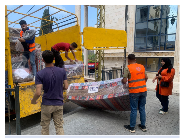
Distribution of Core Relief Items

IOM Egypt has donated 108 Emergency Kits to the Egyptian Ambulance Organization which was donated to IOM by Direct Relief. The kits will be used to support the assistance provided to the Palestinian medical evacuees that are evacuated into Egypt for treatment.