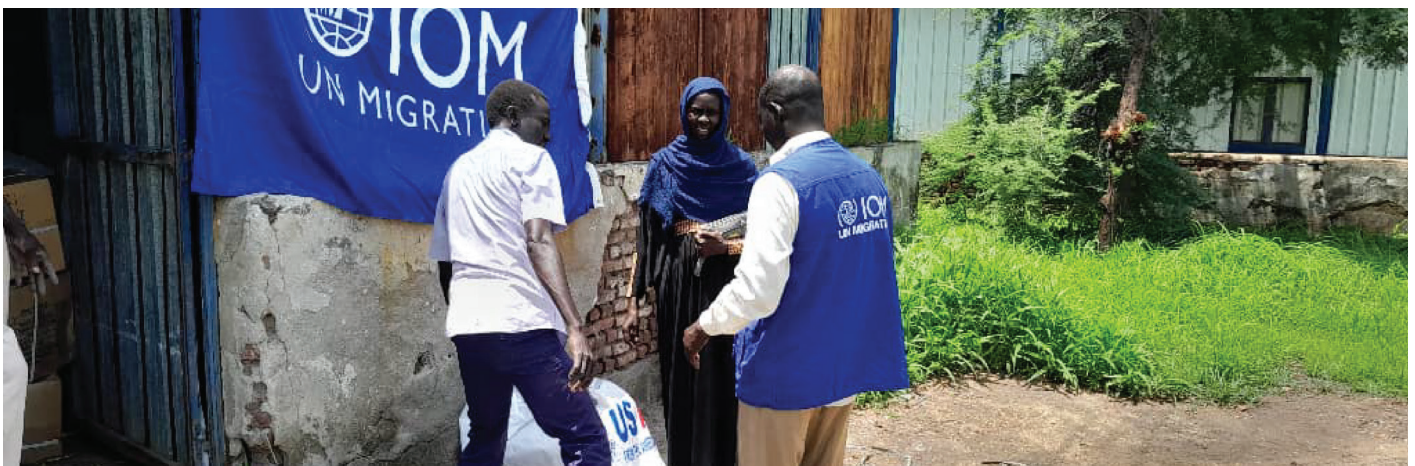
Distribution of lifesaving NFI and hygiene kits to displaced families in Kadugli, South Kordofan

A total of 17,227 individuals have arrived in the Am Dafock point of entry (PoE) in CAR from Sudan as of 18 July. This includes 12,526 Sudanese asylum seekers, and 4,701 returnees. Of the 17,227 arrivals in Am Dafock, 1,003 were relocated to Birao by UNHCR and the local government. As such, the government has instructed partners to concentrate on the response and humanitarian efforts in Birao. IOM's DTM Flow Monitoring teams also report people crossing the border back into Sudan.