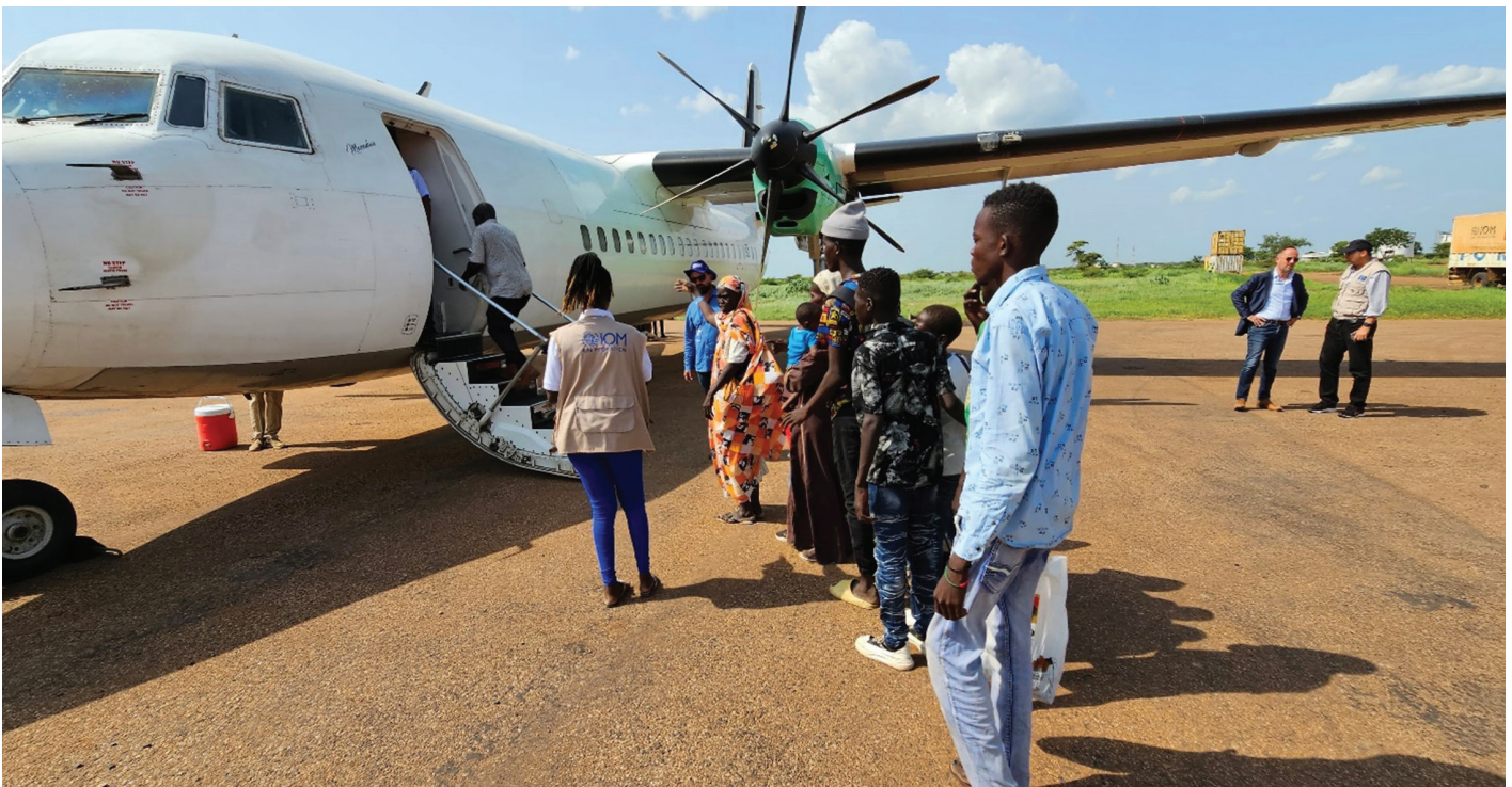
A group of South Sudanese returnees boarding IOM Chartered flight bound for Juba

The WASH team continues to support and coordinate sectoral needs of the returnee population at Malakal transit Centre. Additional sanitation facilities are being constructed at Malakal Airport to support needs of returnee population while their onward transport to their places of origin. In Renk, 467 menstrual hygiene management (MHM) kits were distributed at Joda Reception center and in Wau. In Renk, IOM delivered 120m3 of water daily to Transit Center and Joda. In Bentiu, the routine provision of drinking water to returnees and refugees entering through Panakuach is underway with rapid water quality monitoring. Minimum 6000 L per week are continuously being delivered to the Panakuach POE by water trucking.