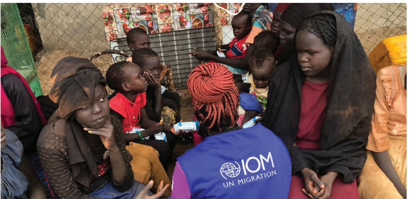
IOM MHPSS staff attending to the returnees on their arrivals from Sudan to Amiet market

IOM and partners on the ground continue efforts to scale up humanitarian assistance and presence across Sudan and neighboring countries, however bureaucratic and administrative impediments continued to limit operational capacity. Additional funding is urgently needed to meet humanitarian needs and support pathways to durable solutions in neighbouring countries.